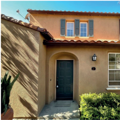
21 Sonata Street Irvine, CA 92618