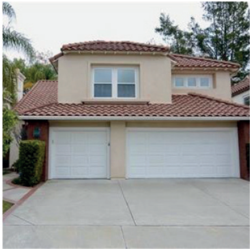
14 Lawnridge Trabuco Canyon, CA 92679