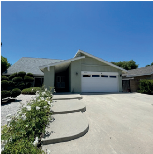
23731 Calle Ganador Mission Viejo, CA 92620